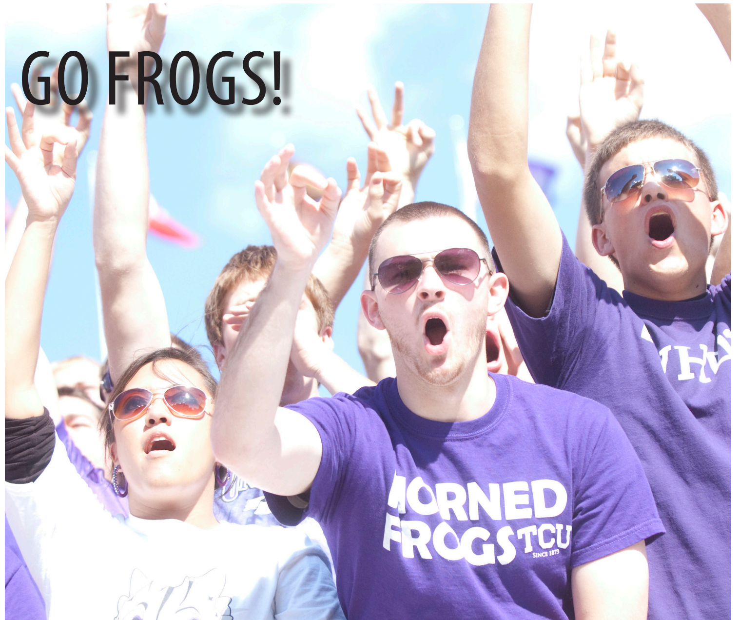
TCU fans cheer the Horned Frog football team to victory.