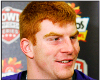
Andy Dalton QB Johnny Unitas Award Davey O'Brien Award Maxwell Award Manning Award