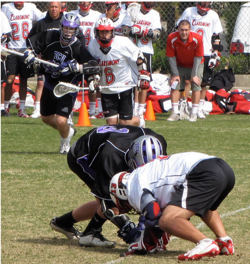
TCULACROSSE.IALAX.COM The lacrosse club tangled with the Claremont College Cougars, resulting in a 12-11 win for TCU on March 14, 2009.